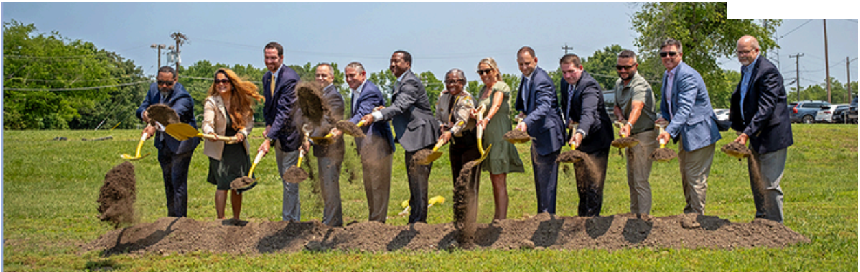
Picture: Henrico County and Pyramid Healthcare broke ground on the Detox and Treatment Center in June 2025, the Center will open by Summer 2026.

The first full year of the renamed “Empower Task Force” was an eventful one. These stories reflect the limitless energy and dedication that our Task Force members bring to Preventing, Treating, and Combating Substance Use in our community.